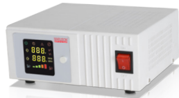
Desk top (DT type)