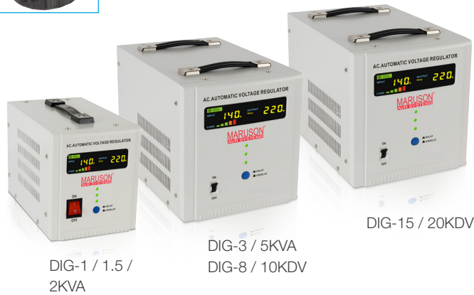
DIG-1 / 1.5 / 2KVA