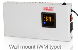
Wall mount (WM type)