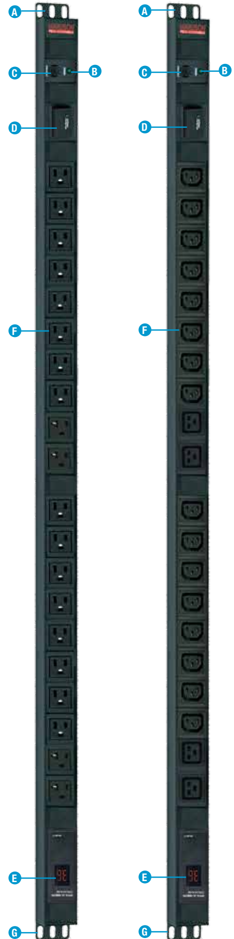
(0U NEMA socket type)